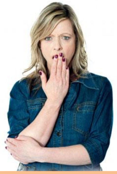
"No way," you exclaim, "everyone drinks milk; everyone knows milk is healthy!"

If you're reaching for that glass of delicious milk...STOP. RIGHT. NOW. Chances are, for as long as you could remember, you've been told by your parents - or relatives, teachers, television commercials - that drinking milk is good for you. They tell you that milk makes you grow stronger and faster. But what they don't know is this: that glass of milk you're about to drink can kill you .